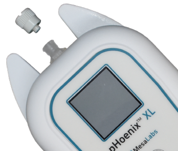
93-0022: Air-Tight Luer Cap